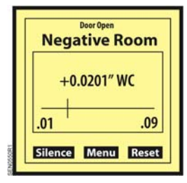
When the door is open, the screen is yellow until the alarm delay is reached