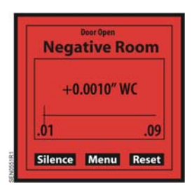
If pressure falls outside of preset limits (Alarmed State), the screen is red

Information in this document is based on specifications believed correct at the time of publication. The right is reserved to make changes as design improvements are introduced. Product or company names mentioned herein may be the trademarks of their respective owners. © 2013 Siemens Industry, Inc.