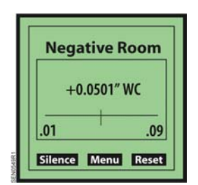
If pressure is normal, the screen is green