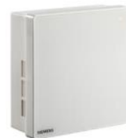
QSA2700 Power Meter W/O Display

Visit us at www.palmettocontrols.com and contact us with your building automation and controls needs.