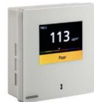
QSA2700D Particle Meter With Display